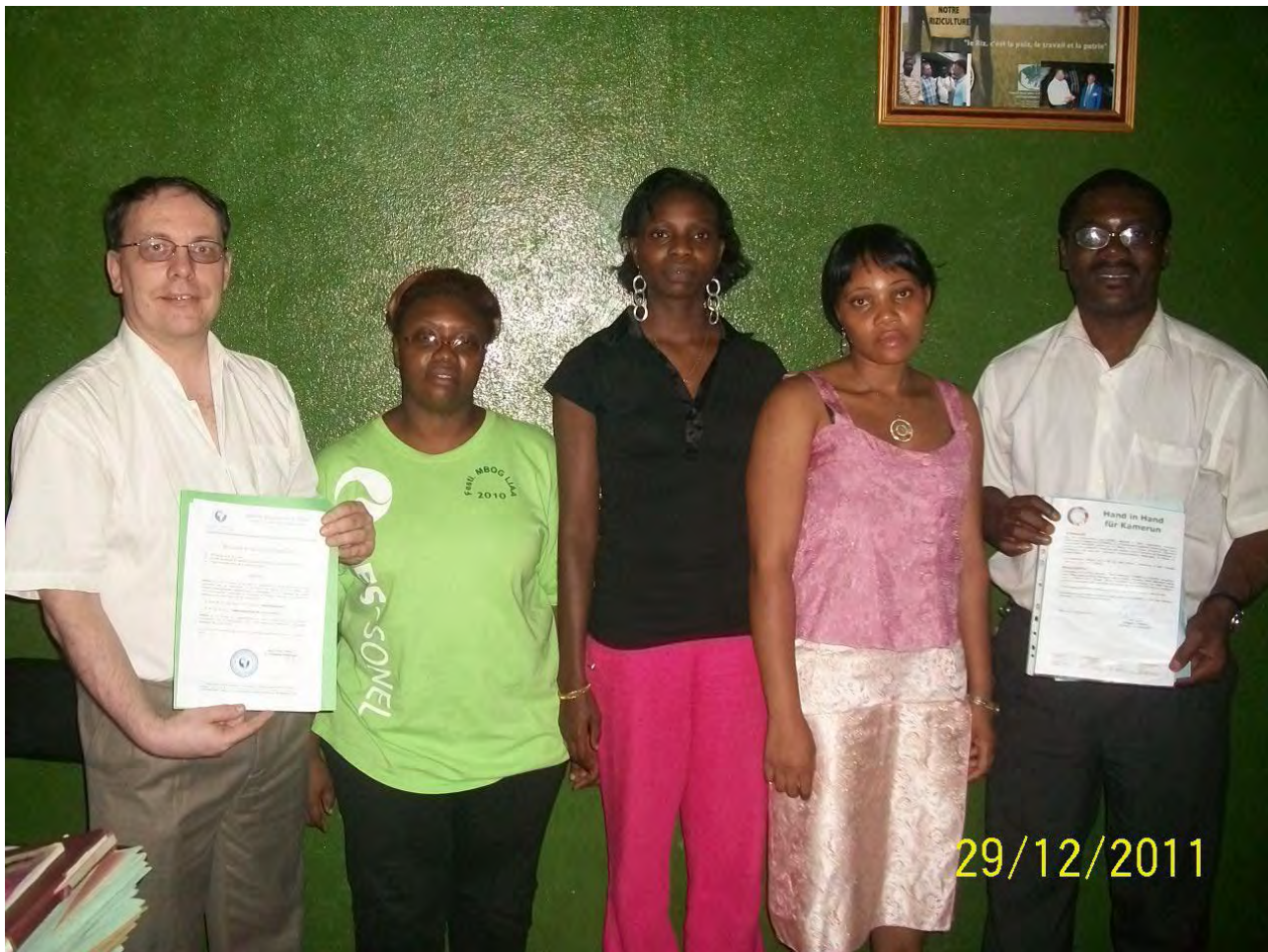
Transfer of records representative

E-Mail: Cameroon@CEFOMECE.org Telephone: (only French speaking) +237 22084571 +237 99808240 +237 75924112