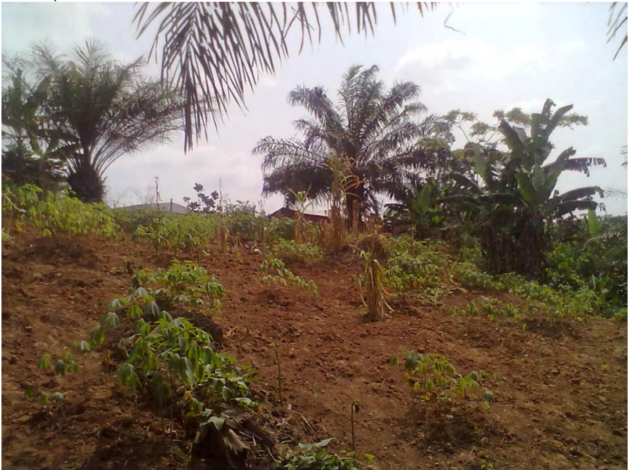
The Land for the hospital

In Africa, every day the sun shines. What could be more natural than to rely on solar energy? In Germany is mainly the power supply. Stream that is not in use is fed into the public grid. Lomié for this system is not feasible. Rather, an autonomous system can be used. For this, the current which is not directly required, is fed into a battery system to control the flow then retrieve, when needed.