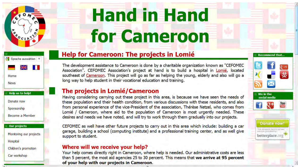
Screenshot of the website http://CEFOMECE.org

The Board was initially on making the Association announced. For this, the website was created http://CEFOMECE.org in German, English and French. The association is looking for donors and sponsors not only in Germany but also in the U.S. and Canada. The logo of the CEFOMECE therefore contains in addition to the flags of Germany, Cameroon and the flags of the United States and Canada.